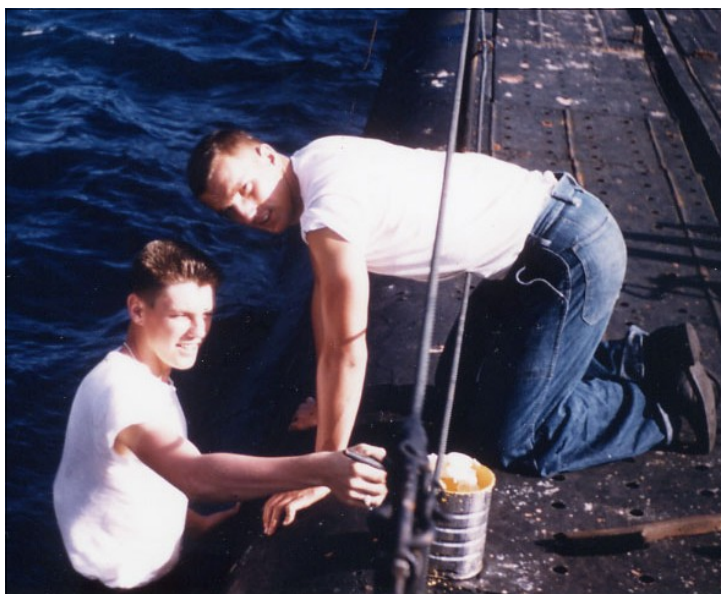
Red Lead Seamanship—1957